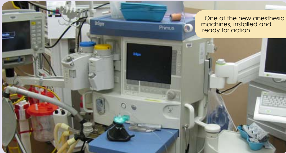
One of the new anesthesia machines, installed and ready for action.

driving again." The new machines allow the doctor to see the results of X-rays, CT Scans, blood work and more on the screen. Patient information